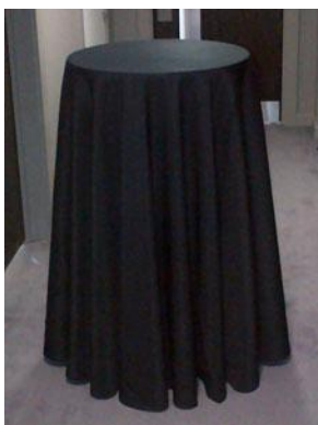
118" round shown on poseur table