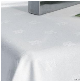
Ivy Leaf detail on White Damask linen