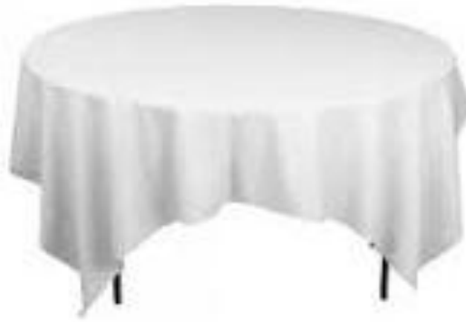
90" x 90" shown on 5ft round table