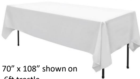
70" x 108" shown on 6ft trestle