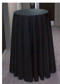
Shown with Black 118" Round cloth