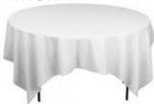
90" x 90" shown on 5ft round table