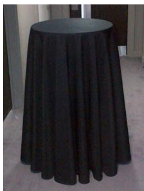
118" round shown on poseur table