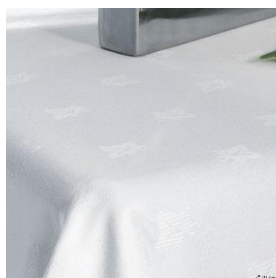
Ivy Leaf detail on White Damask linen