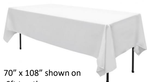
70" x 108" shown on 6ft trestle