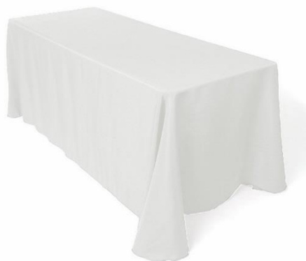
70" x 144" shown on 6ft trestle. Please note other side is shorter