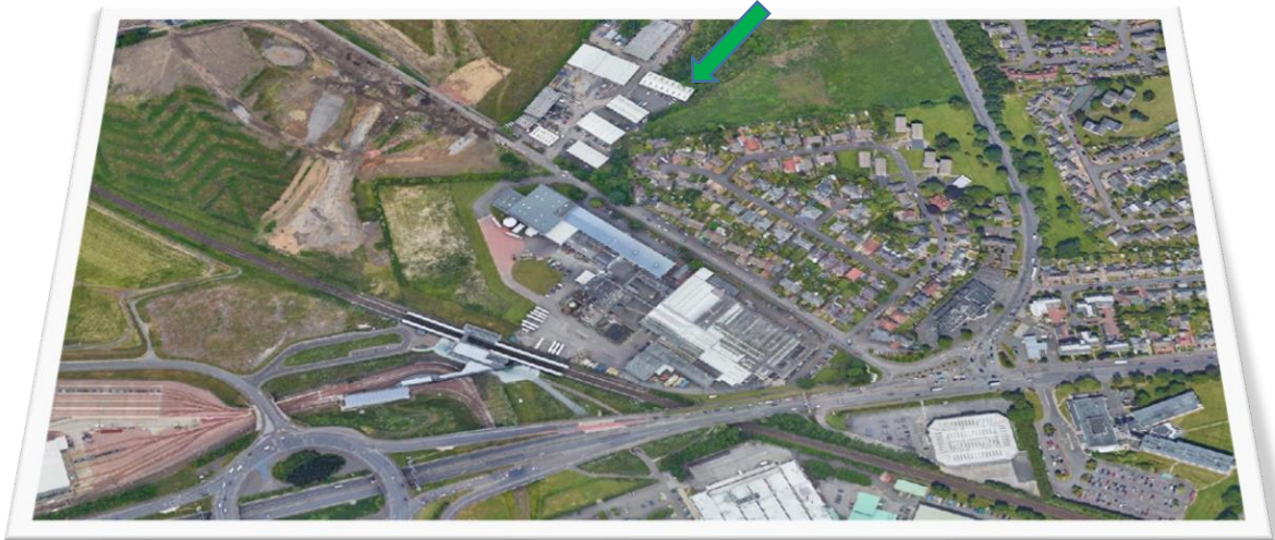
Platehire & Clean

Please contact our sales team on details below.