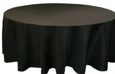
130" round shown on 6ft round table