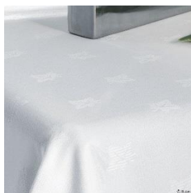
Ivy Leaf detail on White Damask linen